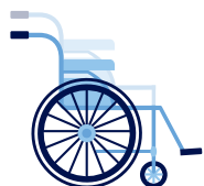
Seat & Backrest Height