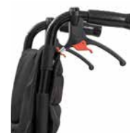
Attendant Brake Kit & Conversion Kit**