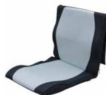
Contoured Padded Overlay*